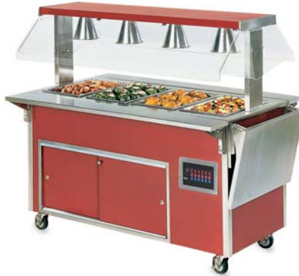
Signature Server® 4-Well Hot Food Station with optional: Access® Buffet Breath Guard with lights, storage, end shelf and plate rests.

See Accessories and Options on the following pages for selection information.