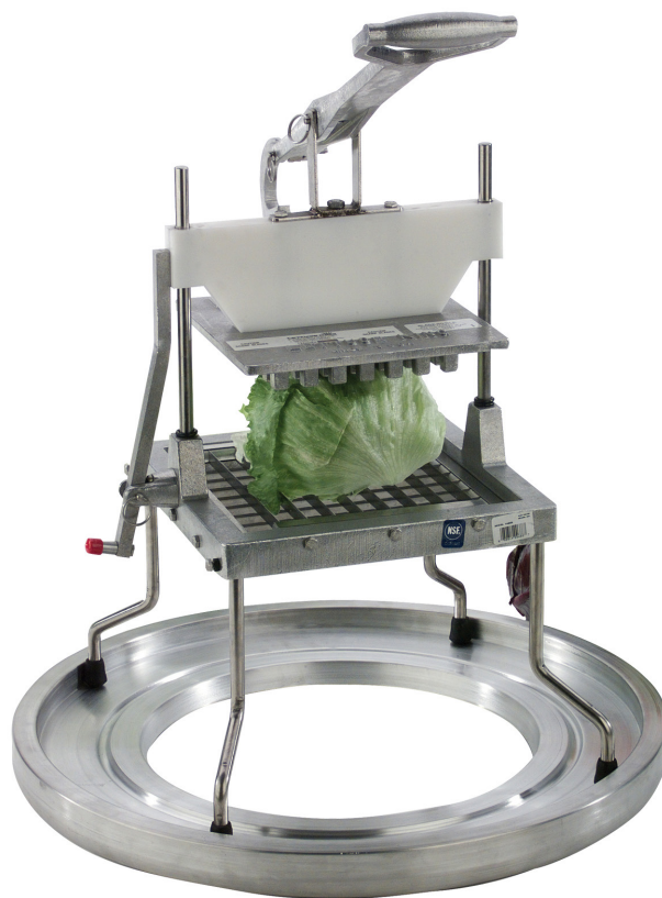
Drum ring pictured with Lettuce King® IV (sold separately).

This Drum Ring has been intended for holding the Lettuce King® IV over Rubbermaid® 20 gallon and 32 gallon containers, hereafter, referred to as "drums." It has not been tested or approved for use on any other container.