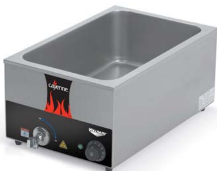
Cayenne® Warmer with Drain – For Export